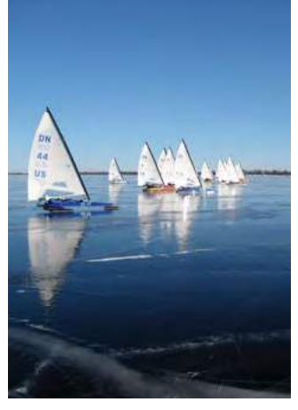
WORLD & NA CHAMPIONSHIP February 2 - 8, 2025 Host: Central Region idniyra.org

WESTERN CHALLENGE An unofficial regatta. December 2024 Minnesota icesailing.net