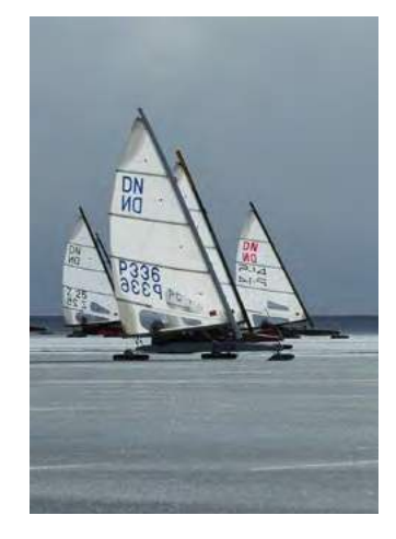
CENTRAL LAKES TBD idniyra.org