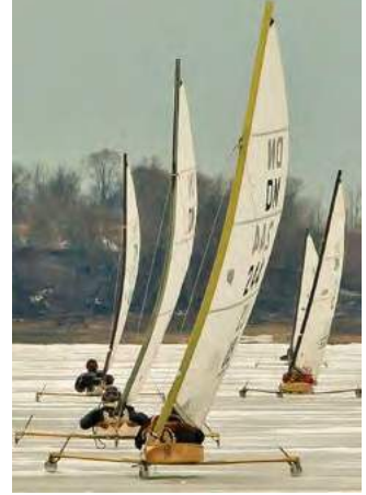
EASTERN LAKES TBD idniyra.org