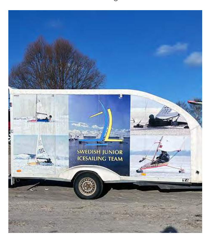
TRAILER GRAPHICS: The Swedish trailer with graphics featuring junior sailors was eye-catching.