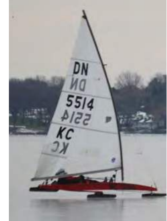
CANADIAN CHAMPIONSHIP TBD idniyra.org