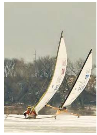
EUROPEAN CHAMPIONSHIP TBD Host: Eastern region. idniyra.org