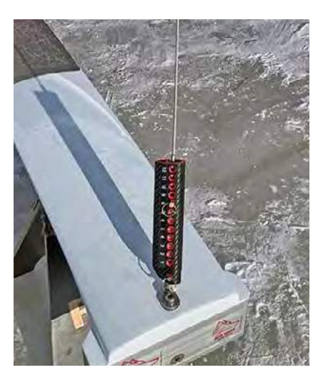
SHROUD ADJUSTER: Here's an aerodynamically shaped shroud adjuster with numbers. I suspect these are available commercially.