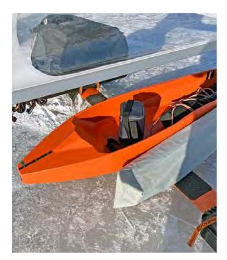
SEAT BACK : It wasn't round, but it looked kind of cool, which gave the boat a different appearance. It will take a better technical mind than mine to determine if that design is within the specifications.

ONE ASPECT OF A NO-WIND DAY IS BEING ABLE TO LOOK AROUND AND SEE WHAT OTHER SAILORS MIGHT BE DOING WITH THEIR EQUIPMENT. DN SAILORS ARE TINKERERS AND INNOVATORS, PROVIDING SOME INTERESTING THINGS TO SEE ON A WALK THROUGH THE MOORING AREA. THERE WERE SEVERAL INTERESTING INNOVATIONS - BOB CUMMINS US3433