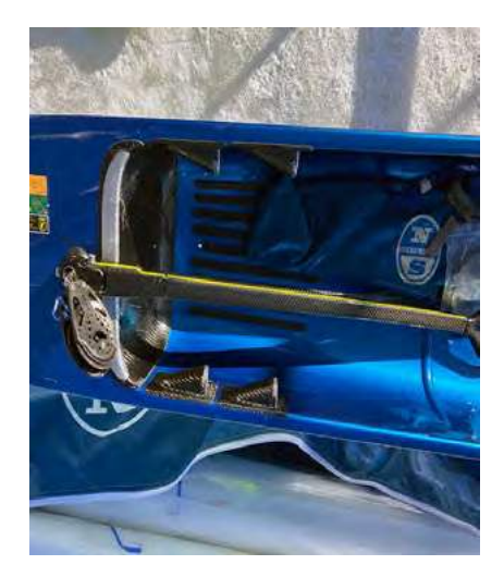
FOOTREST: Looking down into the blue boat shows some unusual footrests. They might be shin-busters, but they probably work well. The materials in them and the front bulkhead are interesting.