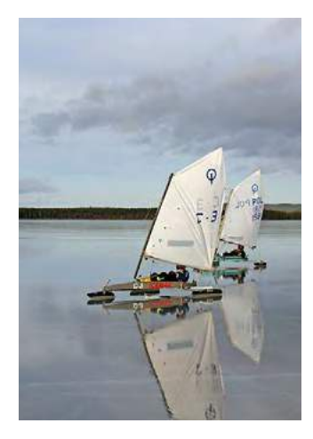
DN & ICE OPTIMIST JUNIOR WORLD CHAMPIONSHIP