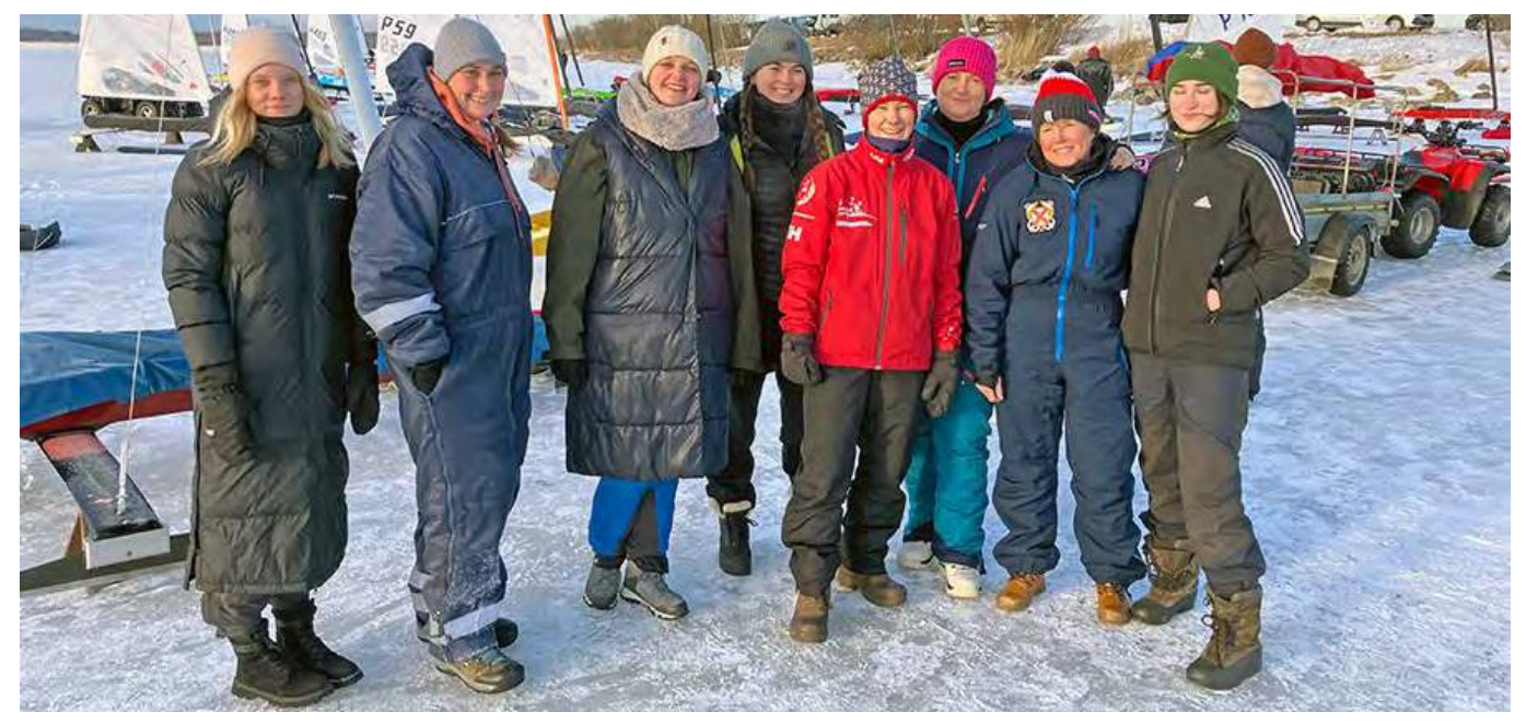
Women of the DN European Fleet

The ice was a fantastic sheet of snow ice that had been rained on. It was smooth and fast with unlimited size. We should be so lucky in North America.