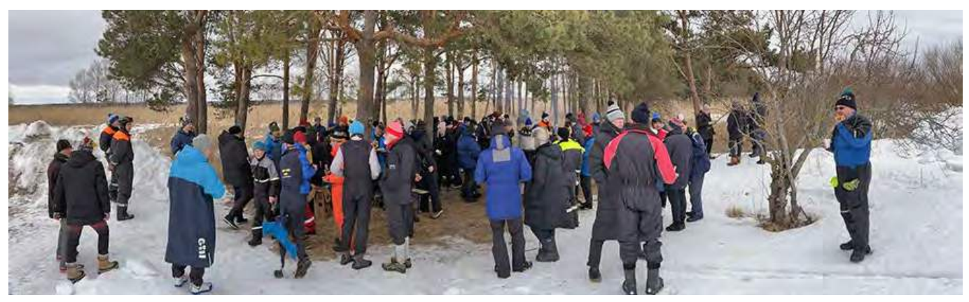
One of the post-race BBQ events sponsored by the different countries and the Ice Optimist fleet.

There was plenty of food at this World Championship. You won't be hungry for anything at a European regatta except more speed. Iceboating is a chance to see the world, and the world hopes to see you on the ice.