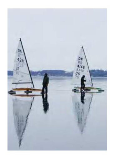
WESTERN LAKES TBD idniyra.org