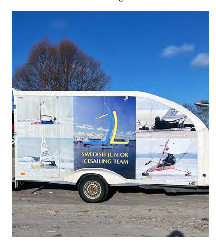
TRAILER GRAPHICS: The Swedish trailer with graphics featuring junior sailors was eye-catching.