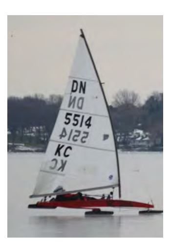
CANADIAN CHAMPIONSHIP TBD idniyra.org