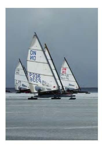
CENTRAL LAKES TBD idniyra.org