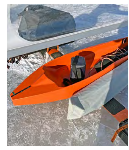
SEAT BACK : It wasn't round, but it looked kind of cool, which gave the boat a different appearance. It will take a better technical mind than mine to determine if that design is within the specifications.

ONE ASPECT OF A NO-WIND DAY IS BEING ABLE TO LOOK AROUND AND SEE WHAT OTHER SAILORS MIGHT BE DOING WITH THEIR EQUIPMENT. DN SAILORS ARE TINKERERS AND INNOVATORS, PROVIDING SOME INTERESTING THINGS TO SEE ON A WALK THROUGH THE MOORING AREA. THERE WERE SEVERAL INTERESTING INNOVATIONS - BOB CUMMINS US3433