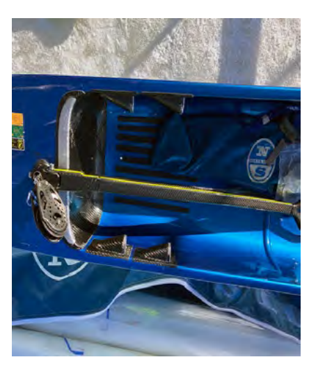
FOOTREST: Looking down into the blue boat shows some unusual footrests. They might be shin-busters, but they probably work well. The materials in them and the front bulkhead are interesting.