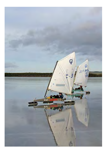
DN & ICE OPTIMIST JUNIOR WORLD CHAMPIONSHIP