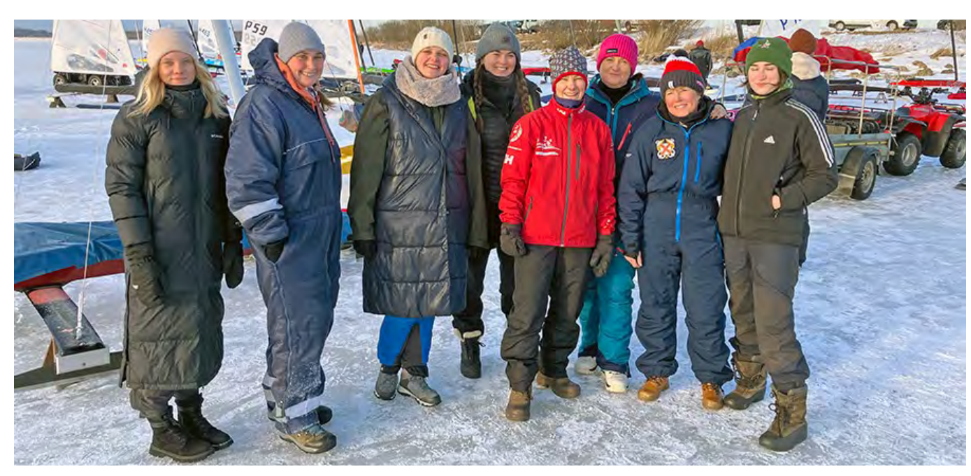
Women of the DN European Fleet

The ice was a fantastic sheet of snow ice that had been rained on. It was smooth and fast with unlimited size. We should be so lucky in North America.