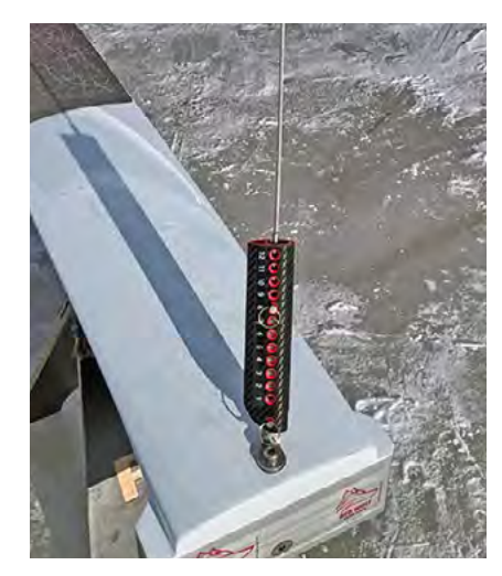
SHROUD ADJUSTER: Here's an aerodynamically shaped shroud adjuster with numbers. I suspect these are available commercially.