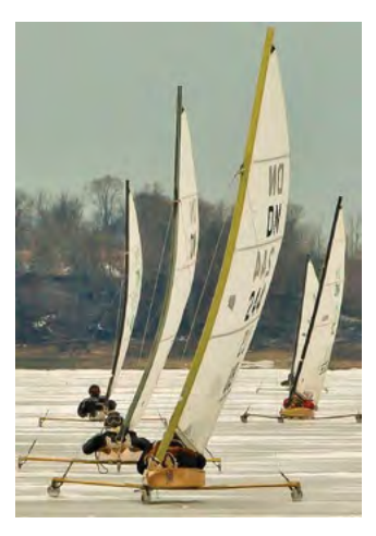
EASTERN LAKES TBD idniyra.org