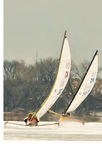
EUROPEAN CHAMPIONSHIP TBD Host: Eastern region. idniyra.org