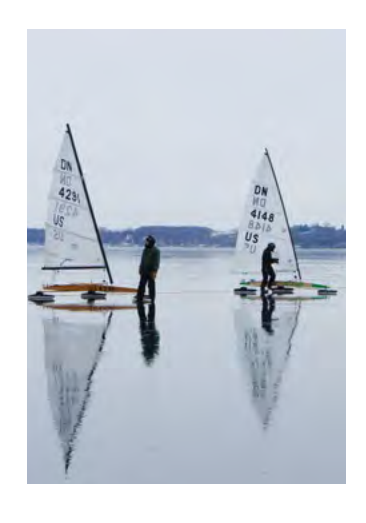
WESTERN LAKES TBD idniyra.org