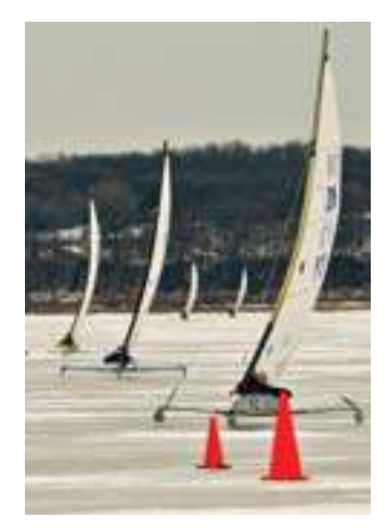
2014 CENTRAL LAKES

To be announced. Website: DN Forum Hot line: 248-988-0851