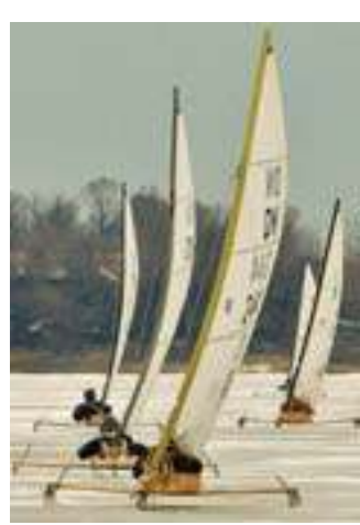
2013 CENTRAL LAKES

December 27-29, 2013 Website: DN Forum Hot line: 248-988-0851