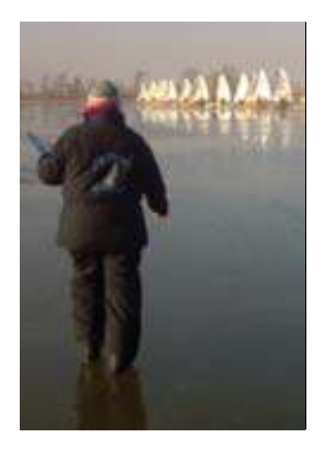
WESTERN CHALLENGE December 6-8, 2013 Minnesota Not an official IDNIYRA regatta