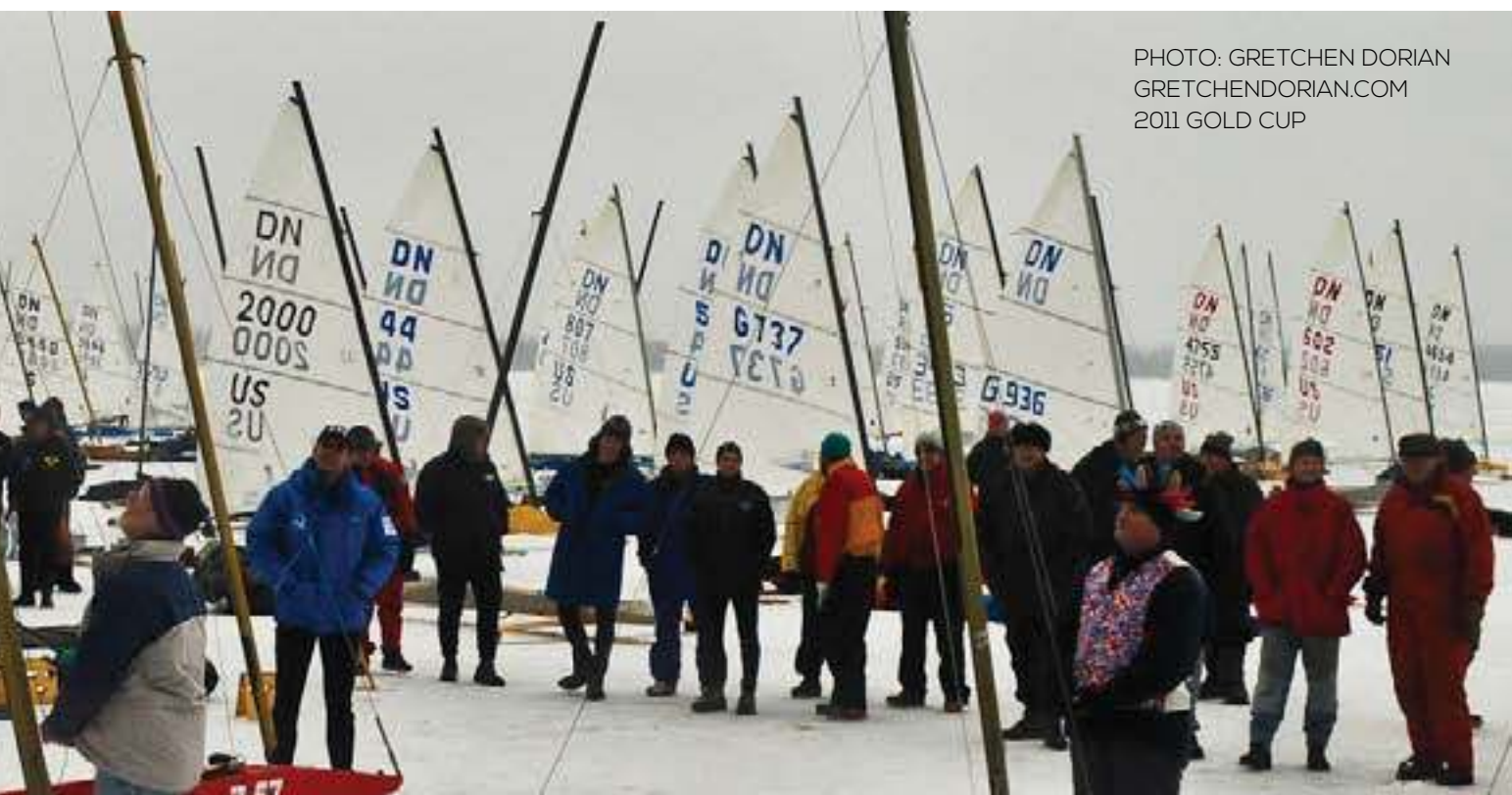
2011 GOLD CUP

Prizes shall be awarded in accordance with the IDNIYRA By-Laws.