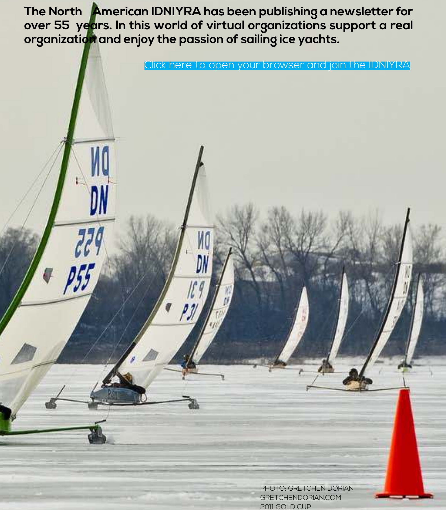
2011 GOLD CUP

Click here to open your browser and join the IDNIYRA