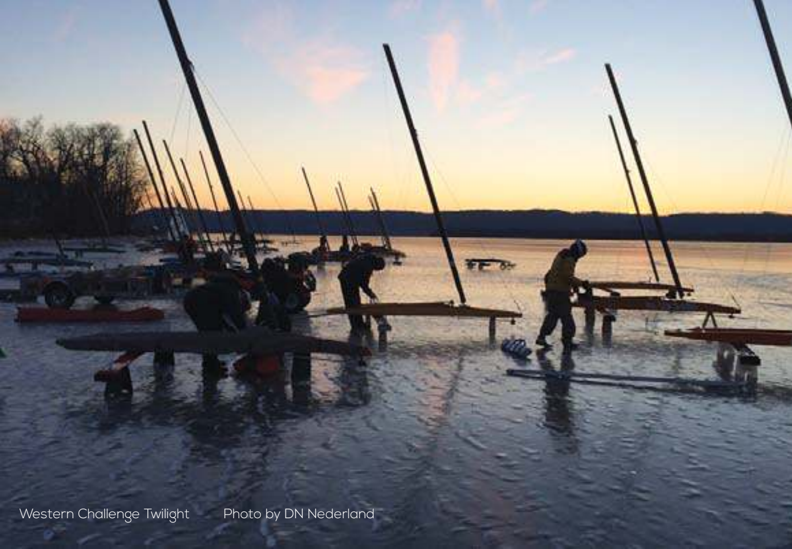
Western Challenge Twilight