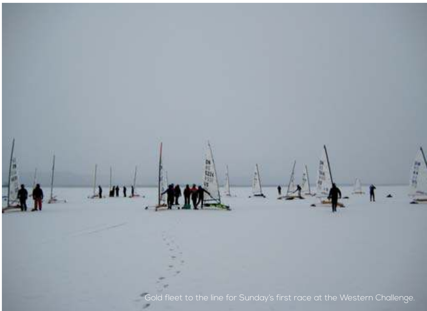
Gold fleet to the line for Sunday's first race at the Western Challenge.