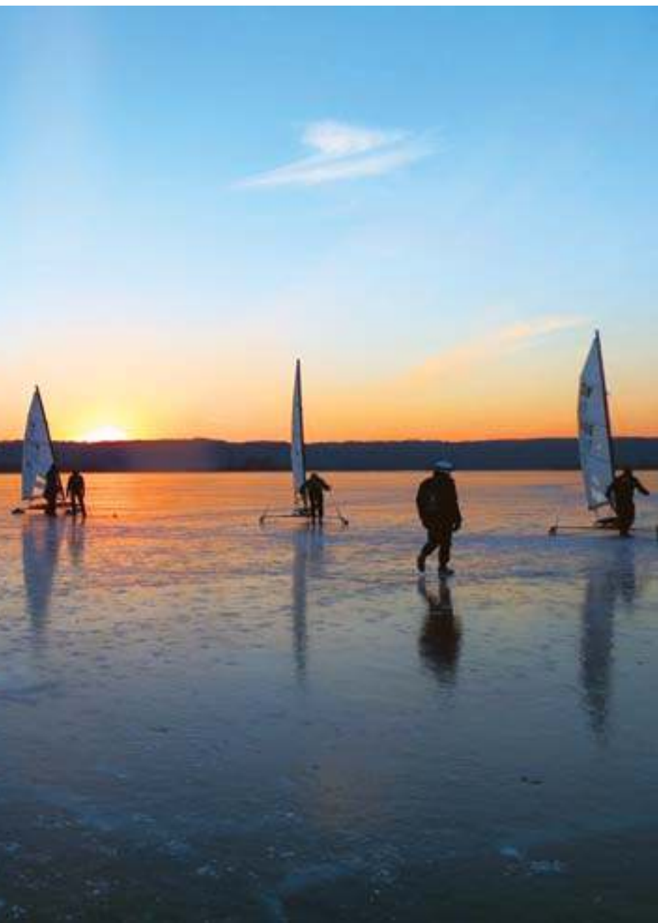
US 44 The Silver fleet lines up for the last race of Saturday at the Western Challenge.

"IT'S GREAT TO SEE THIS MEETING OF FRIENDS TO ENJOY WHAT WE LOVE IN A RELAXED SETTING" US 5214