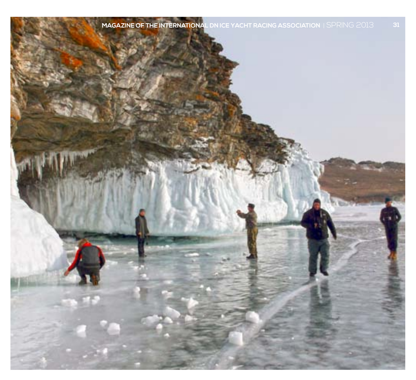
Visiting Baikal's ice caves via hovercraft tour that took us to the deepest part of the lake which is one mile deep.