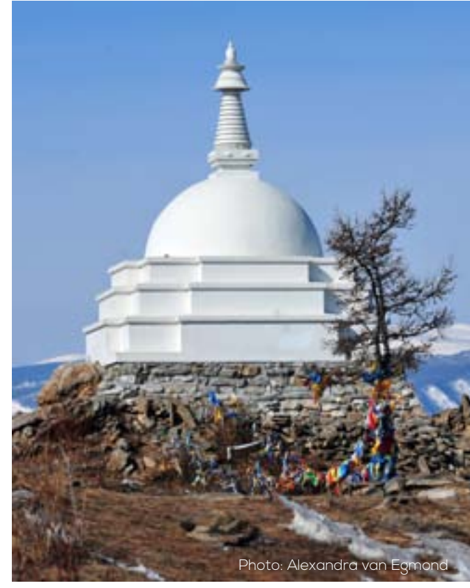
A 27 foot high Buddhist stupa, considered to be offerings to deities, on the highest spot of Ogoy islet not far from the sailing area. This stupa is only one of two that exist in Russia and was built 2005.

THE ASIA AND BAIKAL CUP REGATTA DATES FOR 2014 ARE APRIL 5-15. IDNIYRA EUROPE IS EXPLORING THE POSSIBILITY OF RUSSIA HOSTING THE 2016 GOLD CUP AND EUROPEAN CHAMPIONSHIPS ON LAKE BAIKAL.