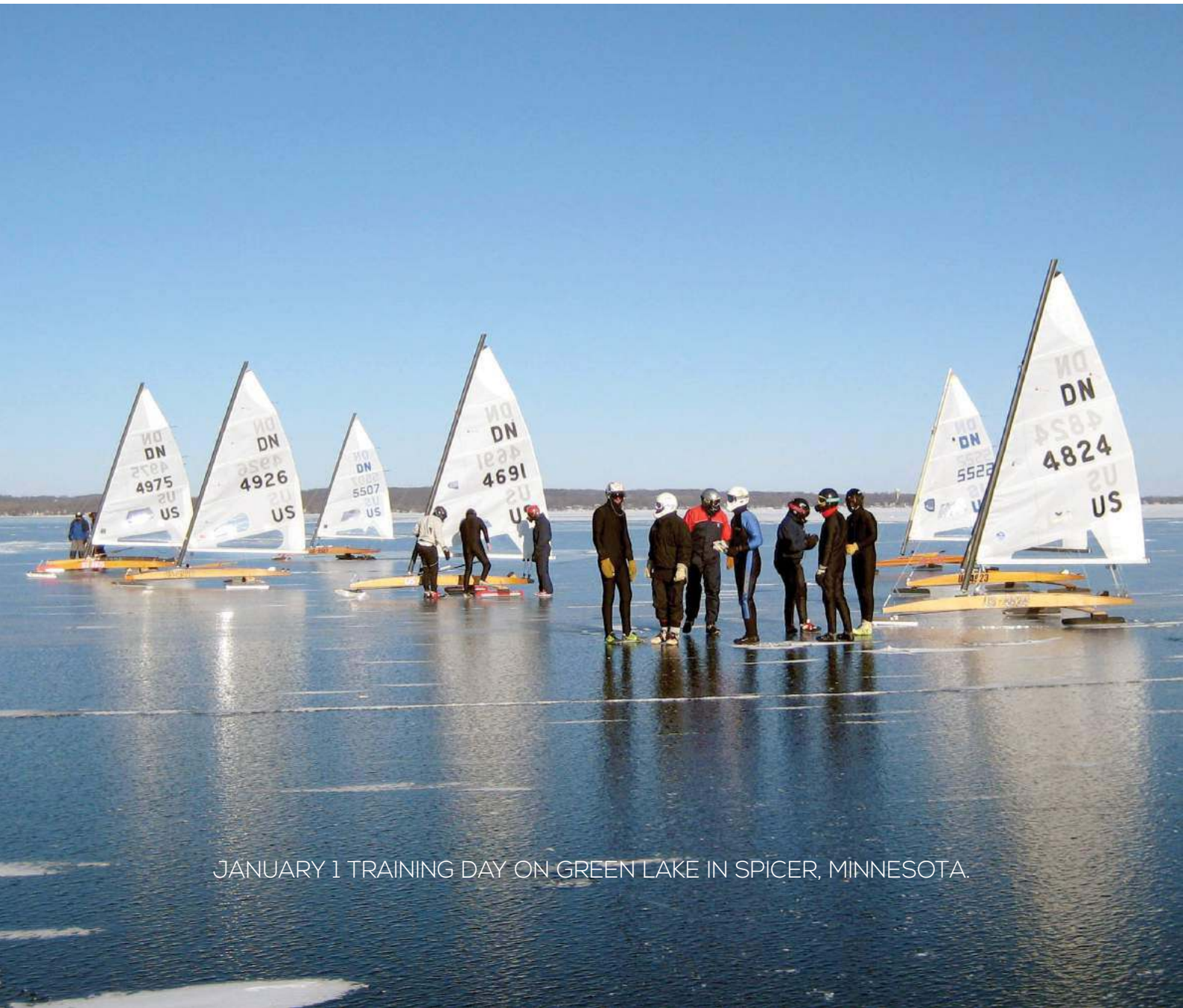
JANUARY 1 TRAINING DAY ON GREEN LAKE IN SPICER, MINNESOTA.

Spicer is a perfect venue for a DN regatta and it's worth your time to learn for yourself the next time the call goes out that Green Lake is ready for ice sailing.