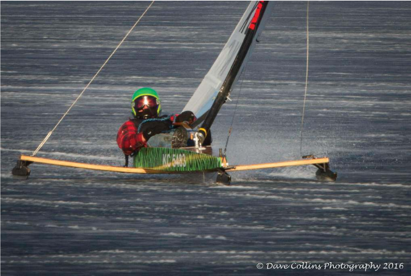
Tyler Garland on a warm day, Lake Mushamush