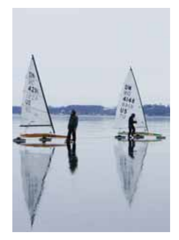
WESTERN LAKES January 5-6, 2019 idniyra.org dnamerica.org/forum/