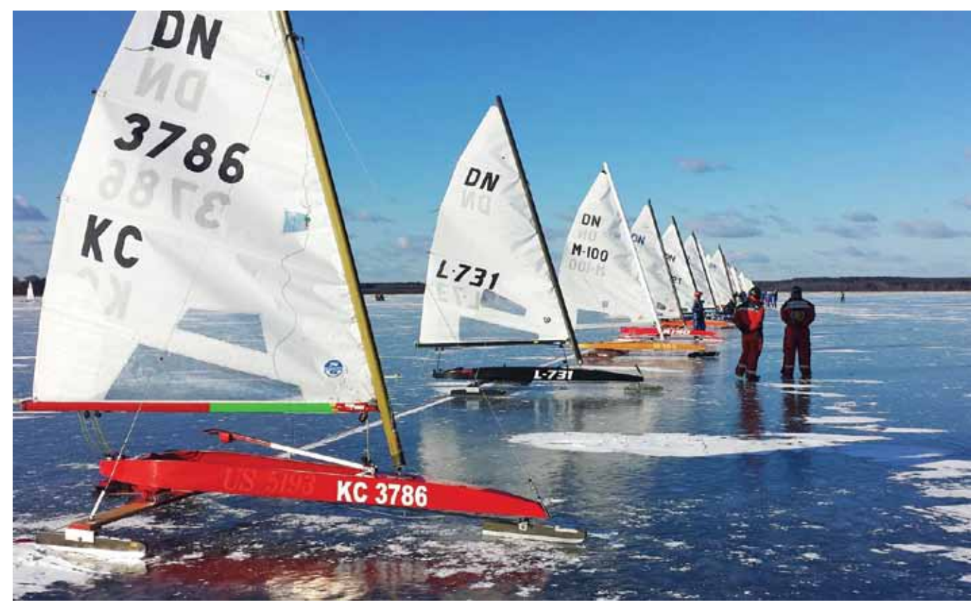
Ultimate humility: ever wonder what start spot 51 looks like?

I had fun, but also frustrations. My ranking put me safely in B (Silver) fleet, but an arthritic knee flareup limited my running abilities. Not being able to run in a European DN regatta is like taking a knife to a gun fight. It is hard to get a good result when you are among the last to the windward mark. I never thought I'd get excited by a finish position that began with a 3! In fairness to truth, I also did a fair amount of 'sailing stupid,' both in terms of boat set-up and tactics.