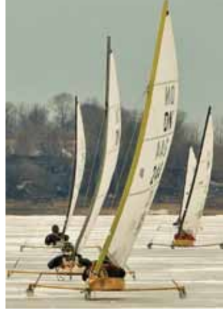
EASTERN LAKES TBA idniyra.org dnamerica.org/forum/

December 1-2, 2018 Best ice in Minnesota iceboating.net