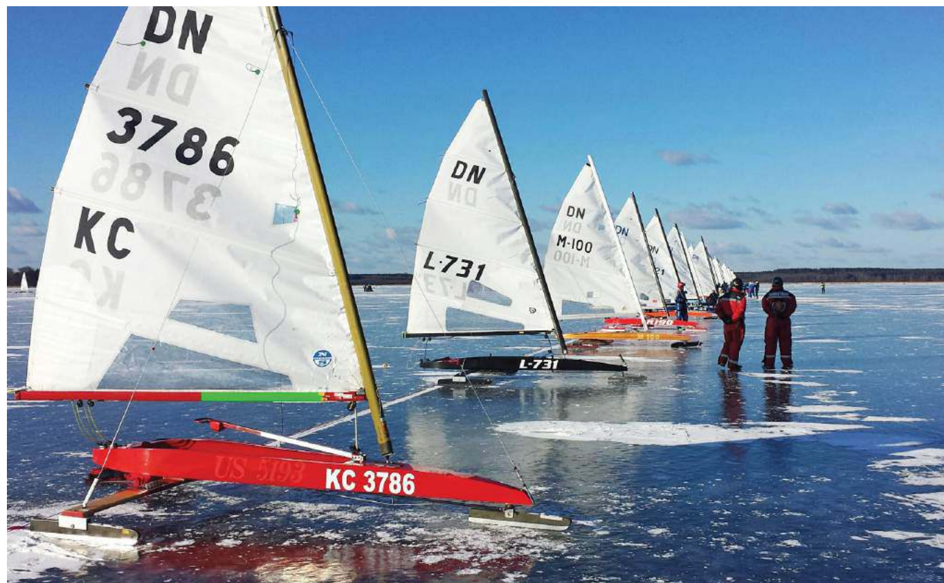
Ultimate humility: ever wonder what start spot 51 looks like?