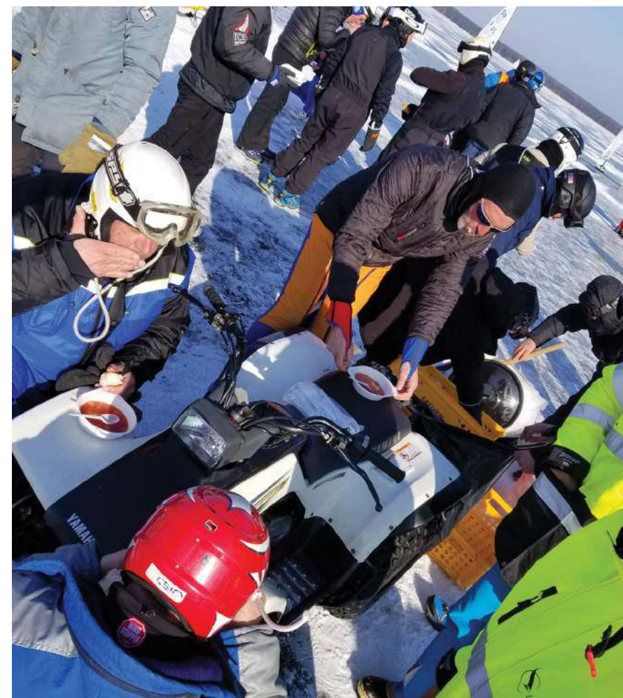
A daily lunch of hot sausage and bean soup delivered to the ice was a welcome antidote to the colder than usual temperatures.

I had fun, but also frustrations. My ranking put me safely in B (Silver) fleet, but an arthritic knee flare-up limited my running abilities. Not being able to run in a European DN regatta is like taking a knife to a gun fight. It is hard to get a good result when you are among the last to the windward mark. I never thought I'd get excited by a finish position that began with a 3! In fairness to truth, I also did a fair amount of 'sailing stupid,' both in terms of boat set-up and tactics.