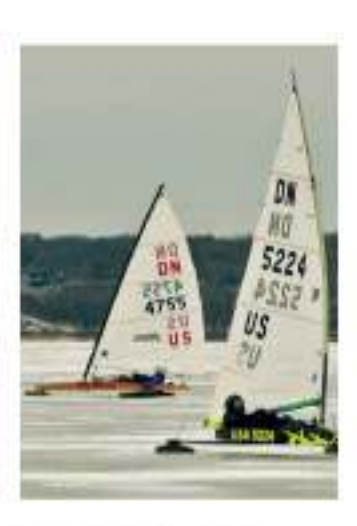
NEW ENGLAND CHAMPIONSHIPS