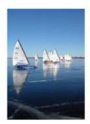
NORTH AMERICAN CHAMPIONSHIP

January 4-5, 2020 idniyra.org dnamerica.org/forum/