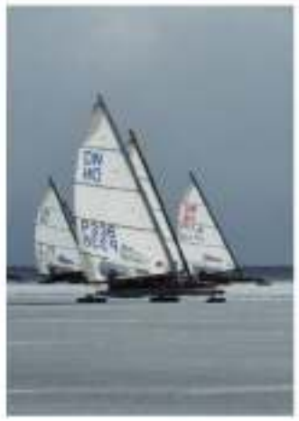
GOLD CUP & EUROPEAN CHAMPIONSHIP

January 18-25, 2020 Host Region: Western idniyra.org dnamerica.org/forum/