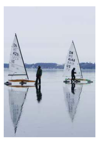
WESTERN LAKES January 2-3, 2020 idniyra.org dnamerica.org/forum/