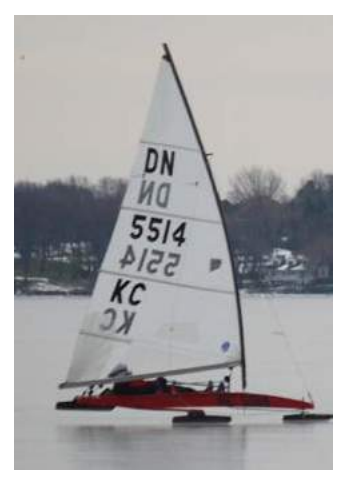
CANADIAN CHAMPIONSHIP TBA idniyra.org dnamerica.org/forum/