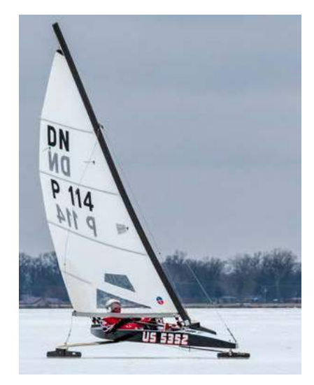
Winning the 2019 Gold Cup in a borrowed boat.

Scorers and Race Committee personnel do not use these hull identification graphics very often for lap management, scoring or collision assessment as originally intended. Also as we saw at the 2019 GC Rule A30 currently makes lending equipment to sailors more difficult with possible SI amendments needed from the OA. The proposed number sizing is 'recommended' so that variances in size of optional numbers would not be subject to protest.