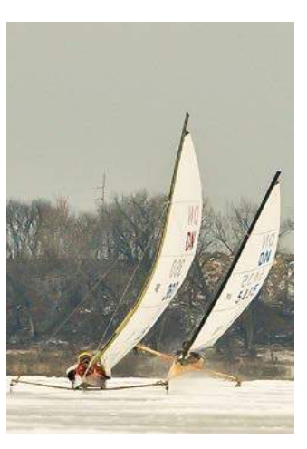
CENTRAL LAKES TBA idniyra.org dnamerica.org/forum/

EUROPEAN February 21-26, 2021 idniyra.eu