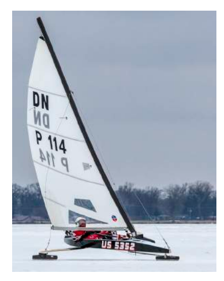
Winning the 2019 Gold Cup in a borrowed boat.

Scorers and Race Committee personnel do not use these hull identification graphics very often for lap management, scoring or collision assessment as originally intended. Also as we saw at the 2019 GC Rule A30 currently makes lending equipment to sailors more difficult with possible SI amendments needed from the OA. The proposed number sizing is 'recommended' so that variances in size of optional numbers would not be subject to protest.