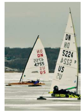
NEW ENGLAND CHAMPIONSHIPS TBA neiya.org