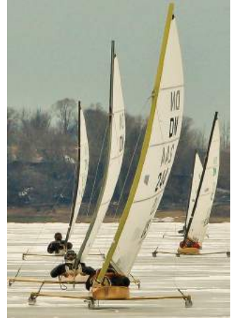
EASTERN LAKES TBA idniyra.org dnamerica.org/forum/

WESTERN CHALLENGE An unofficial regatta. December 2020 iceboating.net