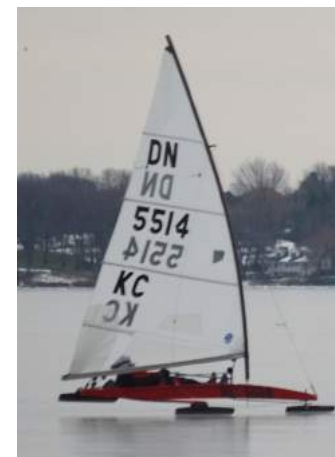
CANADIAN CHAMPIONSHIP TBA idniyra.org dnamerica.org/forum/