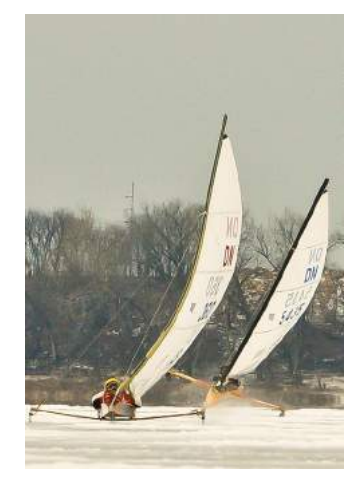
CENTRAL LAKES TBA idniyra.org dnamerica.org/forum/