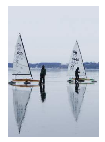
WESTERN LAKES January 2-3, 2020 idniyra.org dnamerica.org/forum/