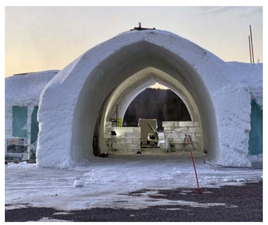
The famous Ice Hotel under construction above the Arctic Circle near Kiruna, Sweden in December 2020.

At the beginning of December, the Facebook ice skating scouts shared information about the Östersund area. At the same time. DN sailors from Östersund had their first sailing days on Lake Mosjön. At first, our focus was on Lake Annsjön, much bigger than Lake Mosjön, but the day before we decide to go, too much snow fell at Lake Annsjön. Luckily Lake Mosjön received only half a centimeter of snow, so we hit the road for a 9-hour drive to Östersund. In the meantime, Piet Ploum H472 arrived at Mosjön and checked the lake. We planned to stay here for five days. Although we don't usually want to have snow on the ice, in this case, it was good training, and we found out what setup worked for us in this kind of condition.