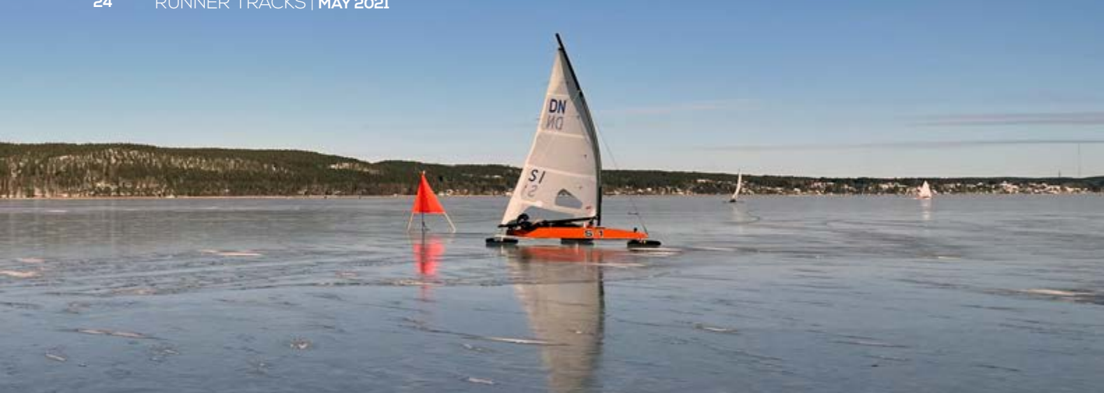
David Croner SI rounds the mark.

It was a nice relaxing sailing day with perfect weather and 4 meters per second (9 miles per hour) of wind, although the ice was quite rough.