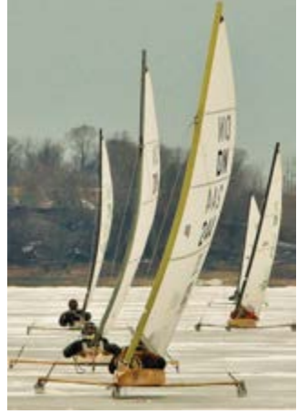
EASTERN LAKES TBA idniyra.org dnamerica.org/forum/

WESTERN CHALLENGE An unofficial regatta. December 2021 liceboating.net