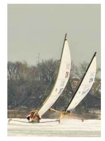
CENTRAL LAKES TBA idniyra.org dnamerica.org/forum/