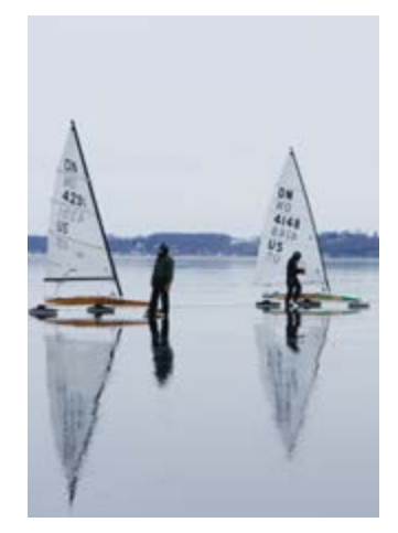
WESTERN LAKES TBA idniyra.org dnamerica.org/forum/