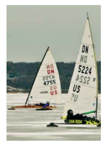
NEW ENGLAND CHAMPIONSHIPS TBA neiya.org