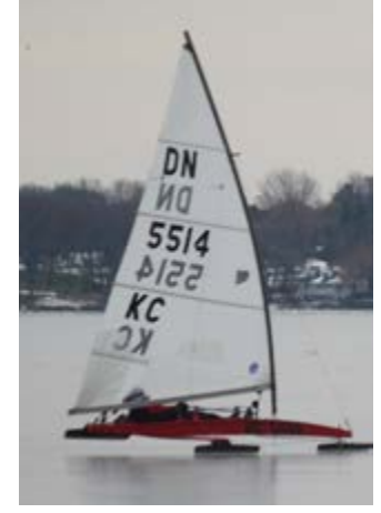
CANADIAN CHAMPIONSHIP TBA idniyra.org dnamerica.org/forum/