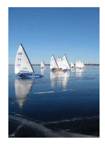
WORLD & NORTH AMERICAN CHAMPIONSHIP

World's 50th Anniversary Celebration January 21-28, 2023 Host: Western Lakes Region idniyra.org