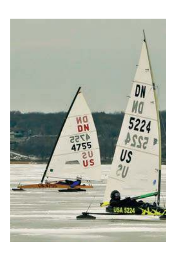
NEW ENGLAND CHAMPIONSHIPS