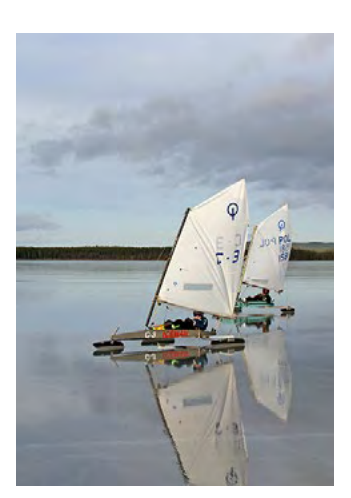
DN & ICE OPTIMIST JUNIOR WORLD CHAMPIONSHIP