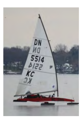
CANADIAN CHAMPIONSHIP TBD idniyra.org