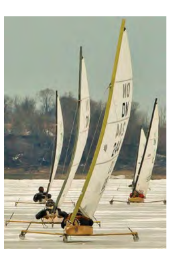
EASTERN LAKES TBD idniyra.org