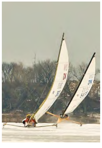
EUROPEAN CHAMPIONSHIP TBD