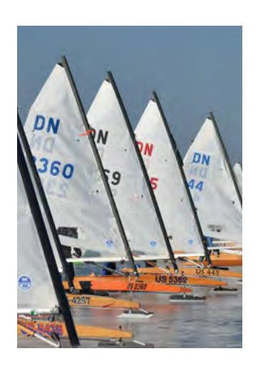
WESTERN CHALLENGE An unofficial regatta. December 2024 Minnesota icesailing.net