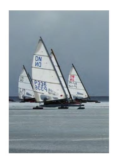
CENTRAL LAKES TBD idniyra.org