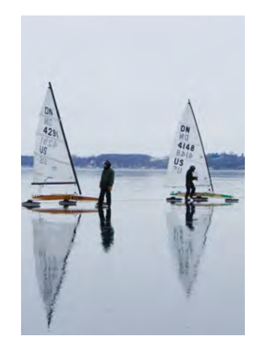
WESTERN LAKES TBD idniyra.org