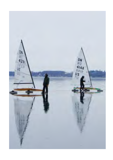
WESTERN LAKES TBD idniyra.org