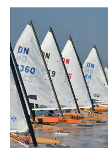
WESTERN CHALLENGE An unofficial regatta. December 2024 Minnesota icesailing.net