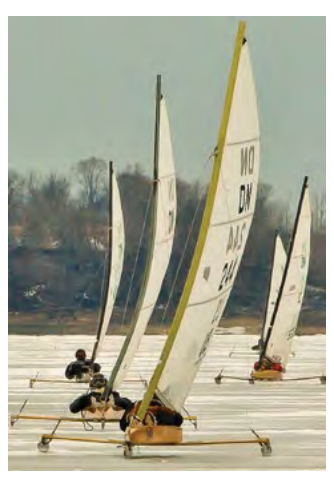
EASTERN LAKES TBD idniyra.org