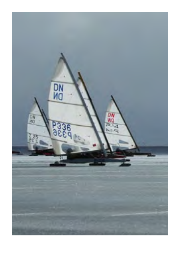
CENTRAL LAKES TBD idniyra.org