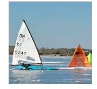
table racing - Mike Bloom US321 &

Challenging condtions, unforget-Karen Binder US5630