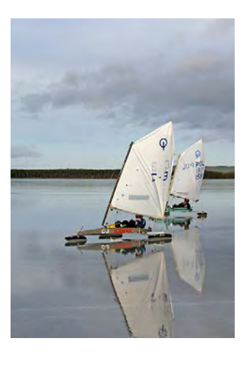
DN & ICE OPTIMIST JUNIOR WORLD CHAMPIONSHIP TBD