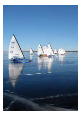
WORLD & NA CHAMPIONSHIP February 2 - 8, 2025 Host: Central Region idniyra.org