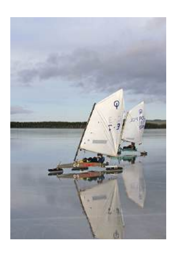
DN & ICE OPTIMIST