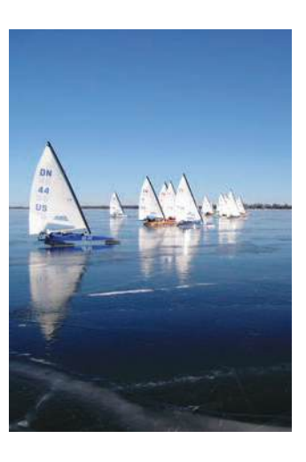
WORLD & NA CHAMPIONSHIP

An unofficial regatta. December 6-8, 2024 Minnesota icesailing.net