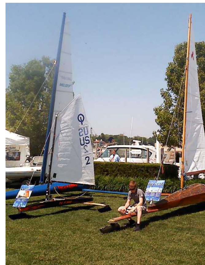
A summer iceboat exhibit is a great way to start building a list of potential iceboaters.

BE THE GUY to pick a day with good conditions, use your contact list of people that want to try ice boating, bring spare equipment, or an old boat you might be willing to sell, two seaters, Skimmers, and take people for their first ride to promote the sport we all love so much.