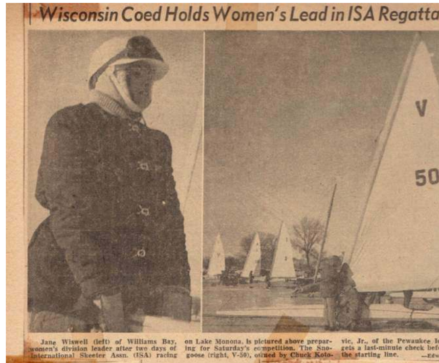
Wisconsin State Journal [Madison, WI], 16 Jan. 1955, Sec.3, p. 1.

WE BOUGHT TWO DNS SO WE COULD TRY TO MAKE A FLEET OVER HERE AND SLOWLY BUT SURELY WE BUILT THE FLEET HERE ON LAKE GENEVA. MY FIRST DN SAIL NUMBER WAS 305.