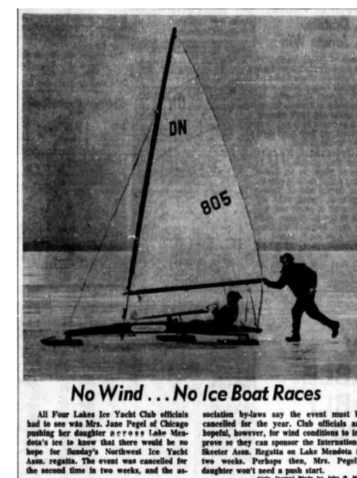
Wisconsin State Journal [Madison, WI], 5 Feb 1968, Sect. 3, p.3

Q: In 1973 the Europeans came to this continent with their DNS for the first Gold Cup which was held at Gull Lake, Michigan. Tell me about that.