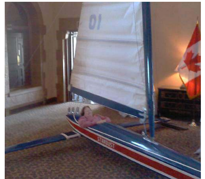
Everyone loves to have their picture taken while in an iceboat.

Make a list of people who tell you they want to try iceboating with their phone numbers and email addresses. Keep the list in the same place all the time so you know where it is. I use the last couple of pages of my order book which is always on my desk. Every time someone says they want to give iceboating a try, I put their contact information on the list. With the pressures and excitement of going out on the ice it is hard to remember those who expressed interest in trying ice boating. Having a list makes it a lot easier and will help you to not forget anyone. Be the guy that contacts everyone who wants to give ice boat sailing a try by having a list and letting them know when conditions are right. Not everyone will be able to go but some will show up and may be hooked for life like we are.